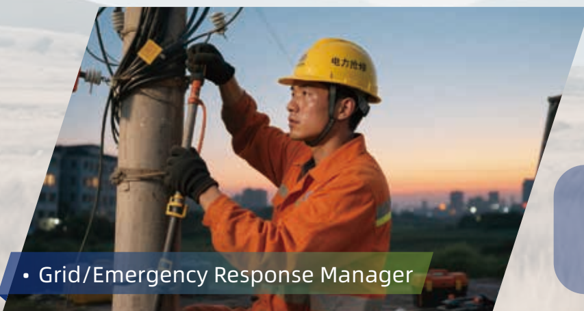
• Grid/Emergency Response Manager

“New construction site without power? High connection fees and slow approvals? Diesel generators are noisy, expensive, and polluting?”