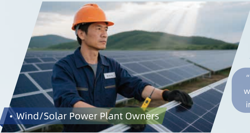
• Wind/Solar Power Plant Owners

Regardless of your industry, we can provide tailored solutions.