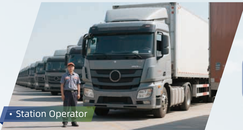
• Station Operator

“Generated electricity cannot be transmitted, watching helplessly as it goes to waste, resulting in lost revenue?”