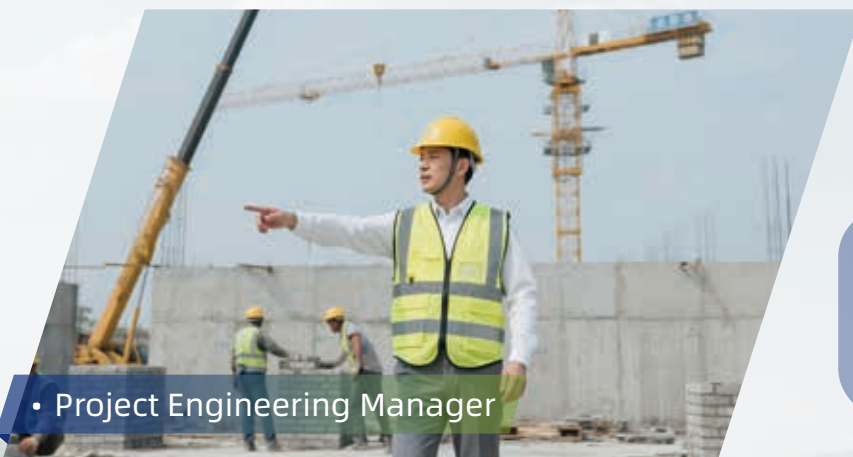
• Project Engineering Manager

“Traditional charging and swapping stations have long construction cycles, cumbersome procedures, and high costs?”